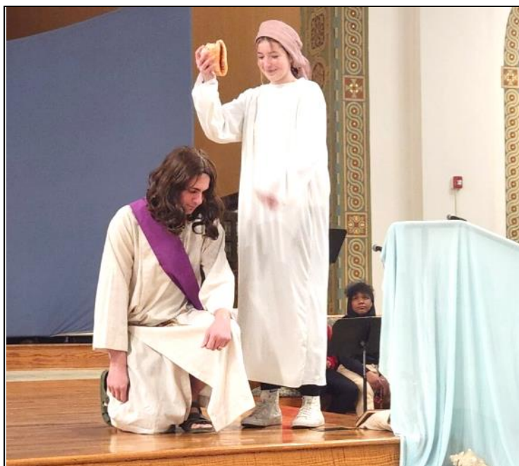
Jesus is baptized in the river during the St. Monica Palm Sunday Passion play.

The kindness and generous love of God our savior appeared, not because of any righteous deeds we had done but because of his mercy.