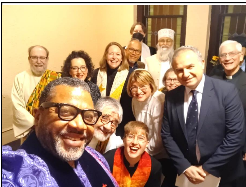
Pastors, rabbis, and imams gather at St. Monica for the 151 st annual Interfaith Thanksgiving Service on November 21, 2022. Thanks to all who joined us for the celebration!