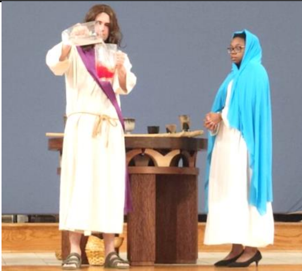
Jesus turns water into wine at the wedding at Cana during the St. Monica Palm Sunday Passion Play in 2024.

2024-2025 CATHOLIC MINISTRIES APPEAL Go to www.dor.org/cma • See how the funds are distributed • Make your gift