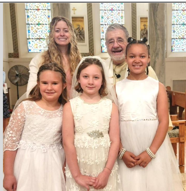
First Communion on June 2, 2024.

We dare to LIVE the LIFE of Jesus Christ, transforming discouragement into HOPE, fear into LOVE, isolation into COMMUNITY.