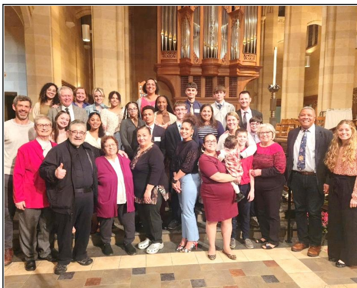
St. Monica families gathered at Sacred Heart Cathedral on April 16 to support our 7 teens who received the sacrament of confirmation.

We dare to LIVE the LIFE of Jesus Christ, transforming discouragement into HOPE, fear into LOVE, isolation into COMMUNITY.