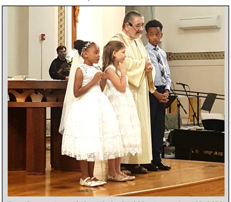
First Communicants help with the final blessing on June 19, 2022.

We are a Resurrection people rooted in our rich Catholic heritage. We are growing in the SPIRIT, as individuals and as a faith community. We answer the CALL to LIVE OUT our Baptismal VOCATION in our daily lives, bringing the LIGHT of Christ's presence to our families, workplaces, neighborhoods, and the WORLD. We dare to LIVE the LIFE of Jesus Christ, transforming discouragement into HOPE, fear into LOVE, isolation into COMMUNITY.