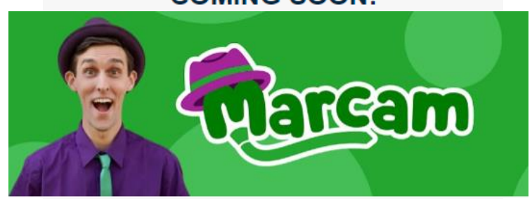
An educational and entertaining Catholic kids show for children ages 2-6!