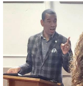
Mayor Malik Evans addresses the group.