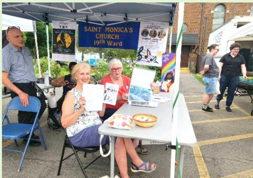
Creation Stewards at Westside Farmers Market on June 25.

Note: Putting non-accepted items into your curbside recycling bin contaminates the entire contents of the bin and makes the machines at the facility unable to recycle those contents.