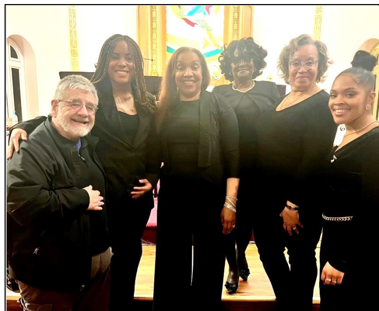
St. Monica Gospel Choir sang at Immaculate Conception/St. Bridget's Songfest on April 27. See page 3.

We dare to LIVE the LIFE of Jesus Christ, transforming discouragement into HOPE, fear into LOVE, isolation into COMMUNITY.